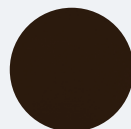
BRONZE POWDER COATED