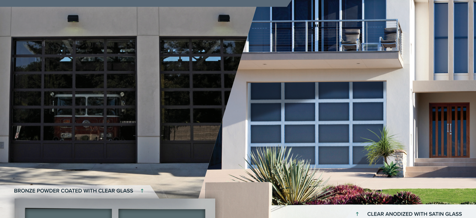
BRONZE POWDER COATED WITH CLEAR GLASS ↑